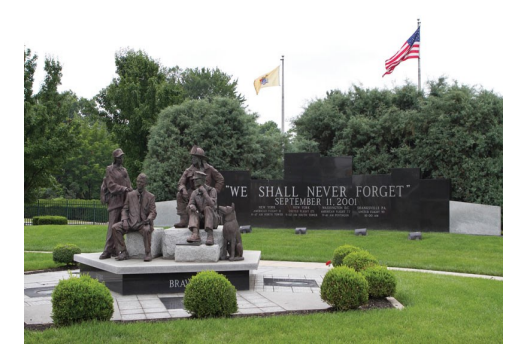
The "We Shall Never Forget" memorial is located in Pennsauken. There are several other memorials located throughout New Jersey!

9.11.15 @ 6:30 P.M. Candlelight Vigil Riverfront at Buck and Main Street Millville