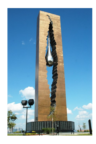
The "Tear Drop Memorial" is located in Bayonne.

9.11.15 @ 8:00 A.M. Memorial Stair Climb Bridgeton Housing Authority high-rise on Commerce Street Brindgeton