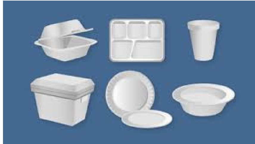
Take out Foam Containers: Banned