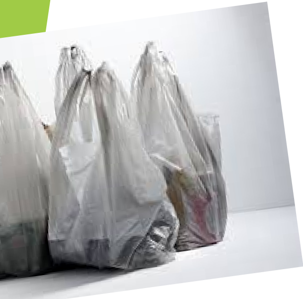
Plastic Bags banned