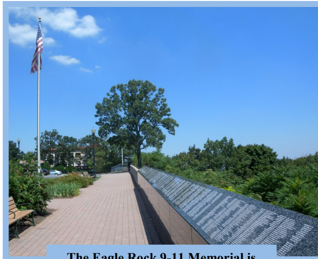
The Eagle Rock 9-11 Memorial is located in West Orange and features gorgeous views of the city.

9/11/2017 @ 7 p.m. Remembrance Ceremony American Legion, 4 JFK Drive. Milltown