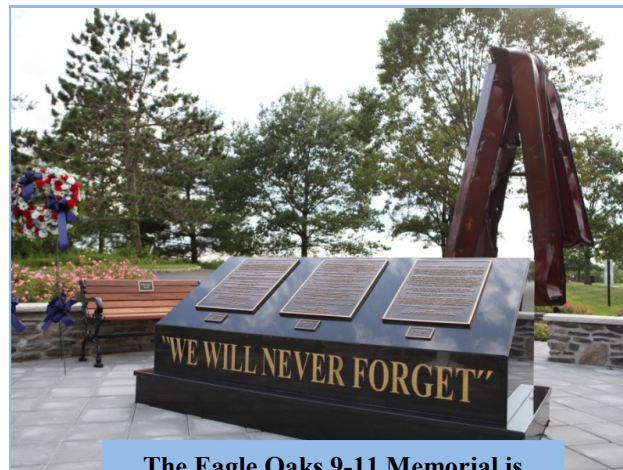
The Eagle Oaks 9-11 Memorial is located in Howell NJ and features a piece of steel from one of the towers.

There are several other memorials and monuments located throughout New Jersey and the tristate area!